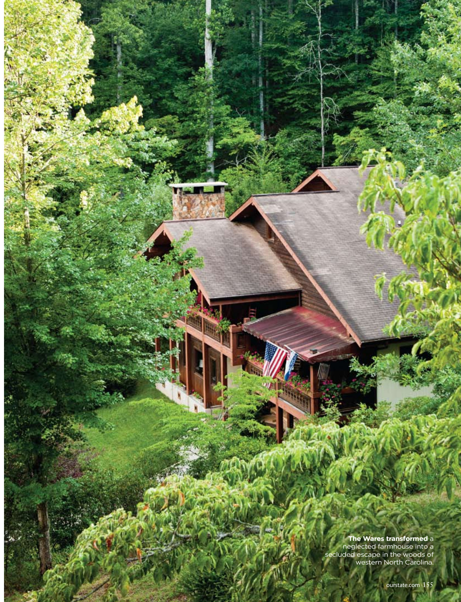
The Wares transformed a neglected farmhouse into a secluded escape in the woods of western North Carolina.